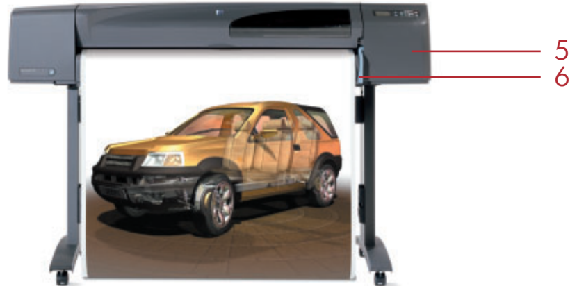
HP Designjet 800 front shown