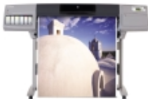
hp designjet 5500 printer (42-inch series)