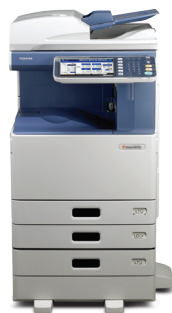
e-STUDIO5055c with Paper Feed Pedestal.