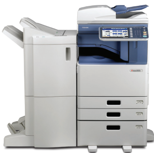
e-STUDIO5055c with Saddle-Stitch Finisher.