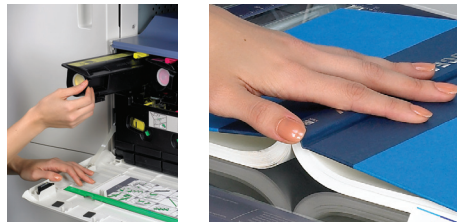
Print professional-looking, full-color newsletters and brochures using an optional saddle-stitch or staple finisher.